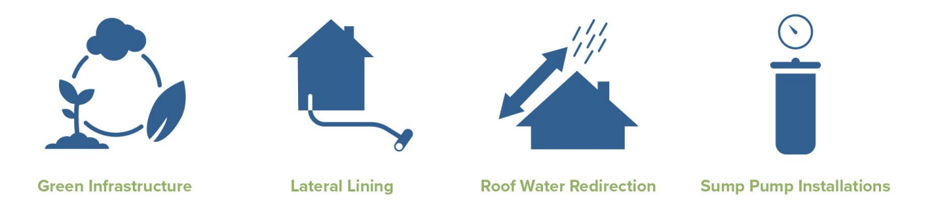
Figure 4. Four pillars utilized by the City to address sanitary sewer overflows within Blueprint Columbus.<sup>10</sup>

The Blueprint Columbus solutions are deemed less expensive, more rapidly deployable, and of greater benefit to the local economy while providing co-benefits to ecosystems and