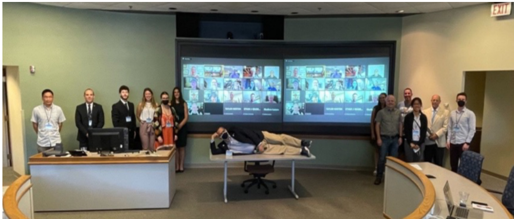
Fig. 1. In-person attendees at the 17th WAMC workshop pose with online attendees.

The upcoming field season, 2022–23, for the UW-Madison AWS network (Fig. 2) will consist of two separate projects and deployments. The deployment of group 1 will be in the early season based out of McMurdo to focus on Cape Hallett and Alexander Tall Tower while completing standard service work. Group 2 will prioritize West Antarctica to recover Austin and Kathie while completing the West Antarctic Tall Tower installation. Both groups will continue tests on the polar climate and weather stations (PCWS), a joint project between UW-Madison and Madison Area Technical College while raising