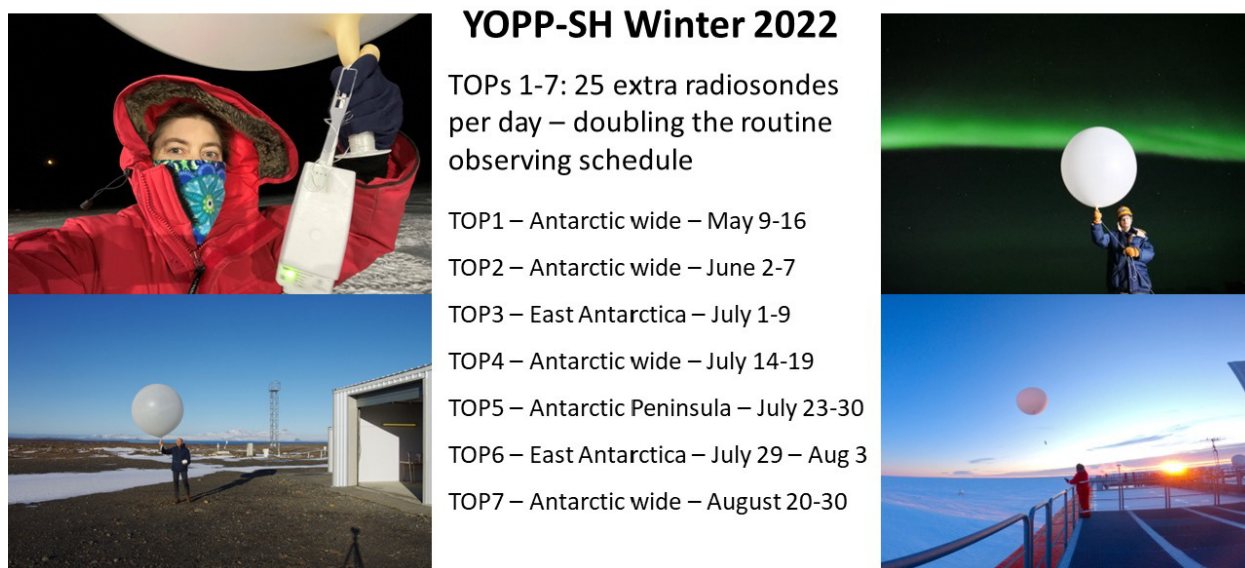
Fig. 3. YOPP-SH TOPs throughout the winter 2022 season.

by backing up plots and analyses. Art Cayette's forecast discussions for the TOPs are being added to the AMRDC archive as well. Group forecast discussions to initiate the TOPs are available in the Slack app and all videos and pictures sent from the stations are stored in a Dropbox account and posted on the social media accounts set up by the Byrd Polar and Climate Research Center. The last topic discussed in this section was that microwave rain radar (MRR) processed data, radiation measurements, and Micropulse Lidar (MPL) data should also be included in the AMRDC archive.